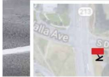
■ Site / Entry ID | V-shaped double-sided Structure