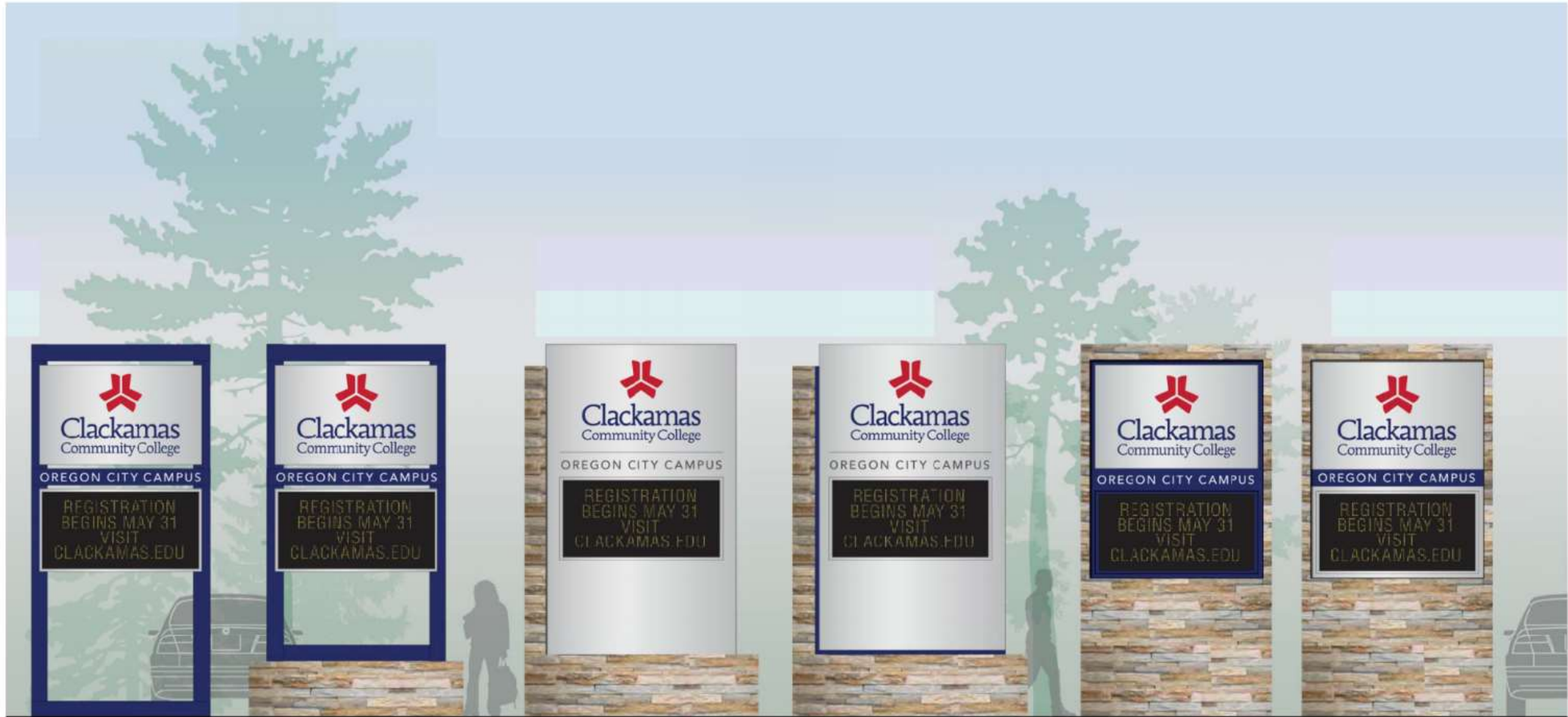
Option 1 Original Design Concept based on Harmony Campus