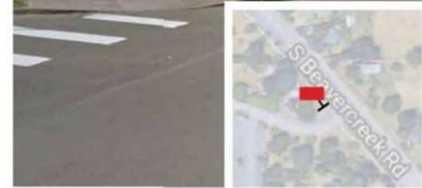
■ Site / Entry ID | Standard double-sided Structure