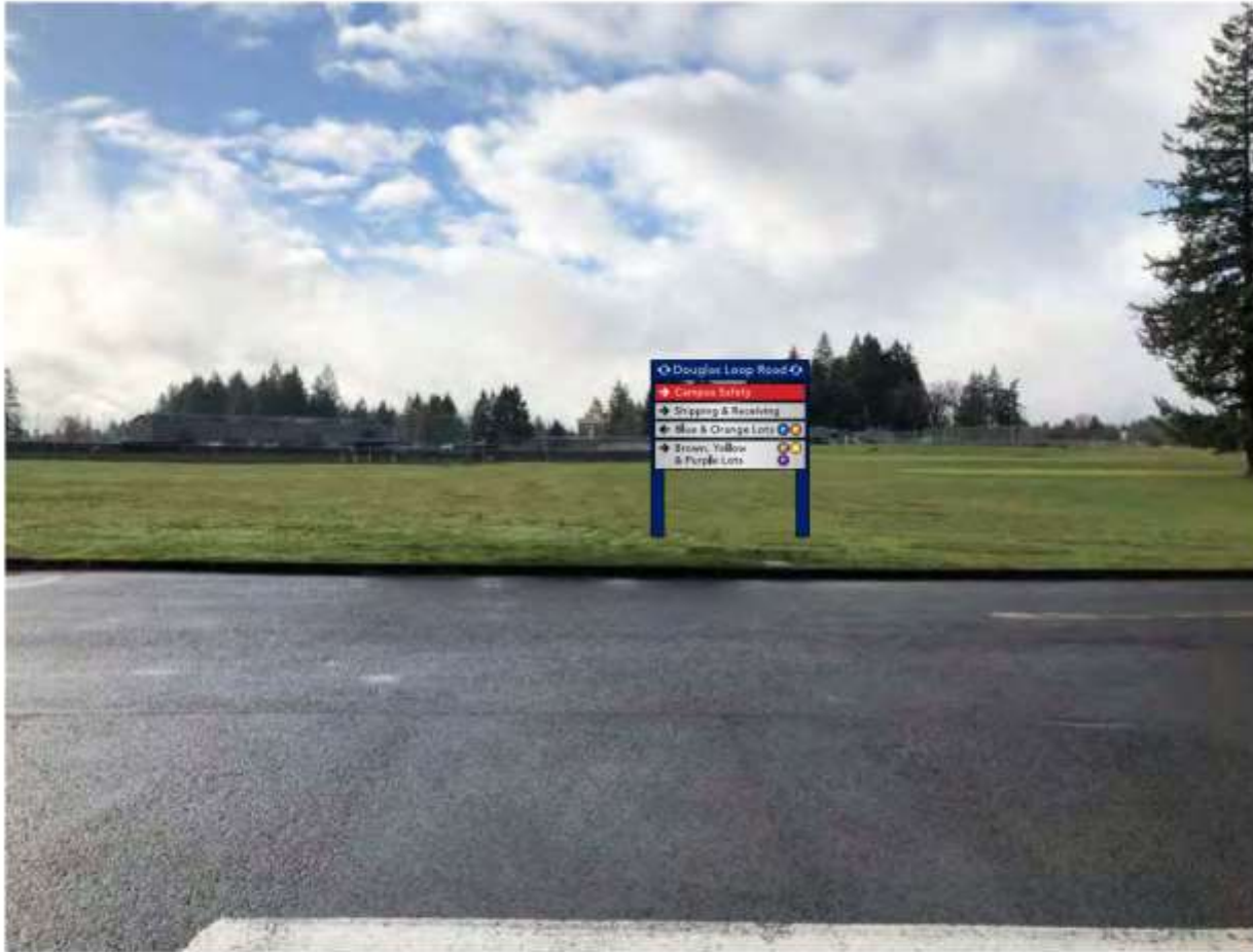
Vehicular Directional Single-Sided