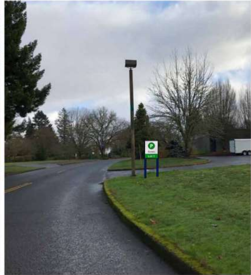
Parking Lot ID Double-Sided